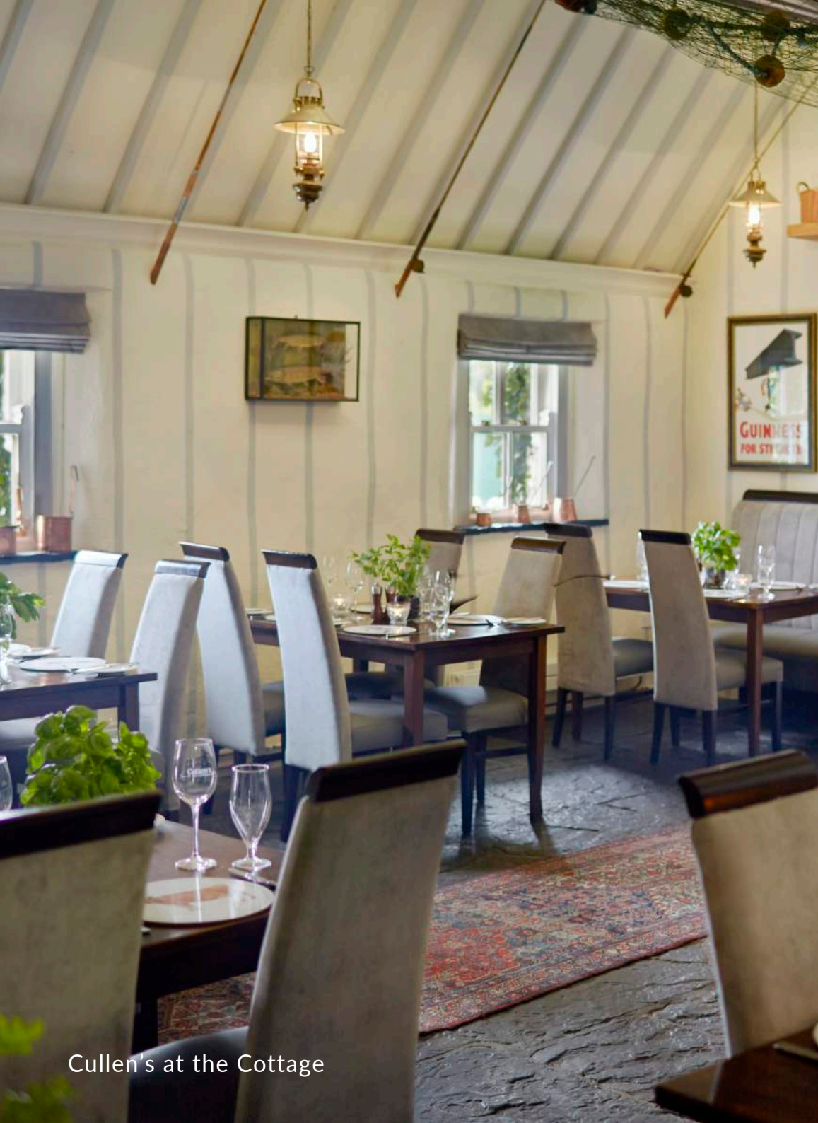
Cullen's at the Cottage